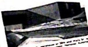
SOLD 70,000 sq. ft. warehouse at 38th and Wells St. in A.S. Industrial Service. Our client: National Auto and Parts.