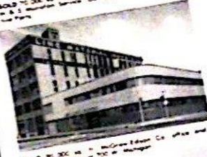
SOLD 70,000 sq. ft. McGraw-Hill Co. office and administrative building at 700 W. Washington.