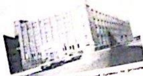
SOLD Entire block of 74 Water and houses for prime developer. Our client: Cultural Resource, Inc.