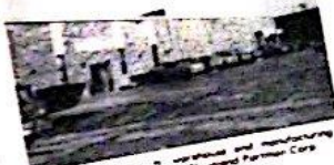
LEASED 25,000 sq. ft. warehouse and manufacturing building at 334 W. Vogel to Cleveland Partner Corp.