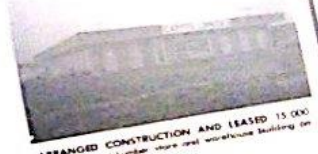
ARRANGED CONSTRUCTION AND LEASED 15,000 sq. ft. Capital Lumber store and warehouse building on My 18 in Wauwatosa.