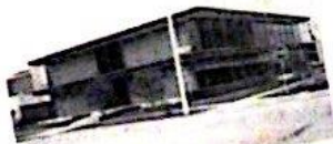
SOLD 10,000 sq. ft. office building at 200 N. Jefferson to W&L Corp.