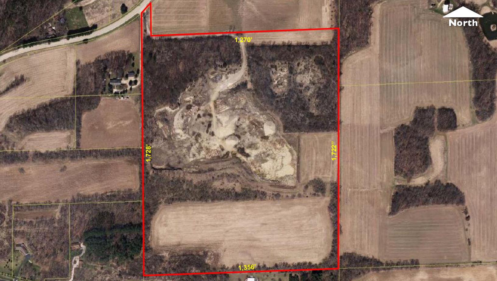
*Dimensions are taken from GIS map and Buyer should perform it's own Alta Survey