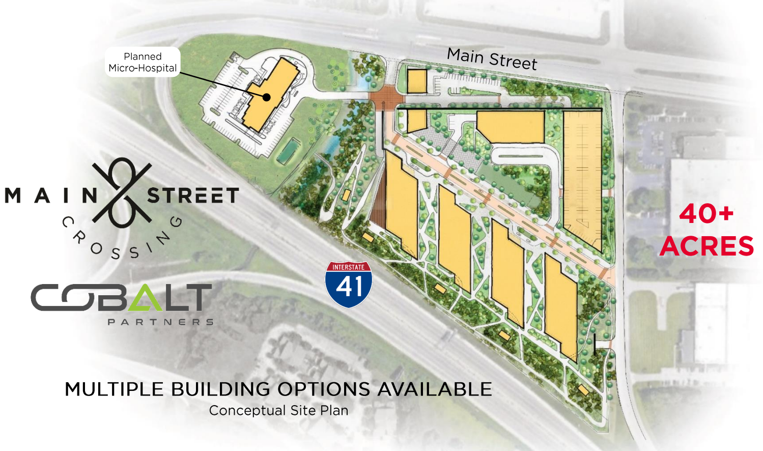
MULTIPLE BUILDING OPTIONS AVAILABLE Conceptual Site Plan