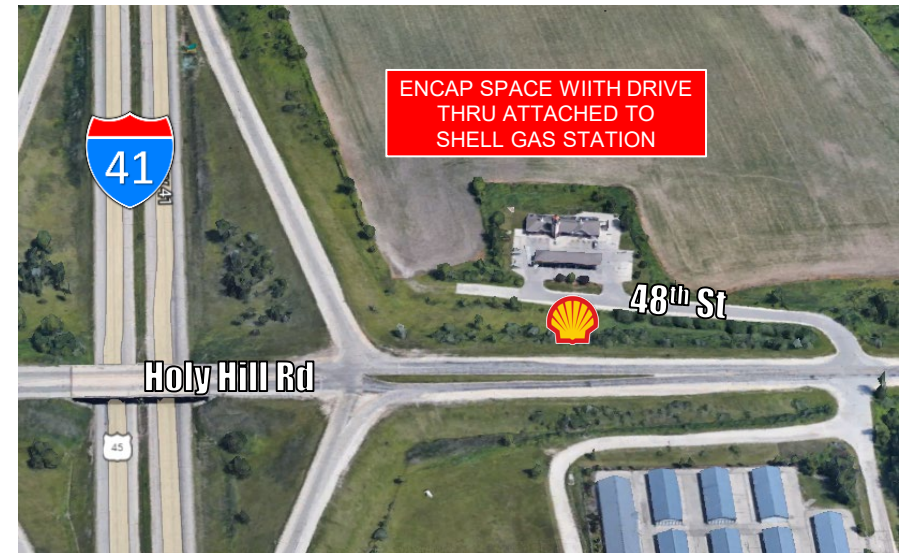
Aerial facing north; subject site accessible via Holy Hill Rd